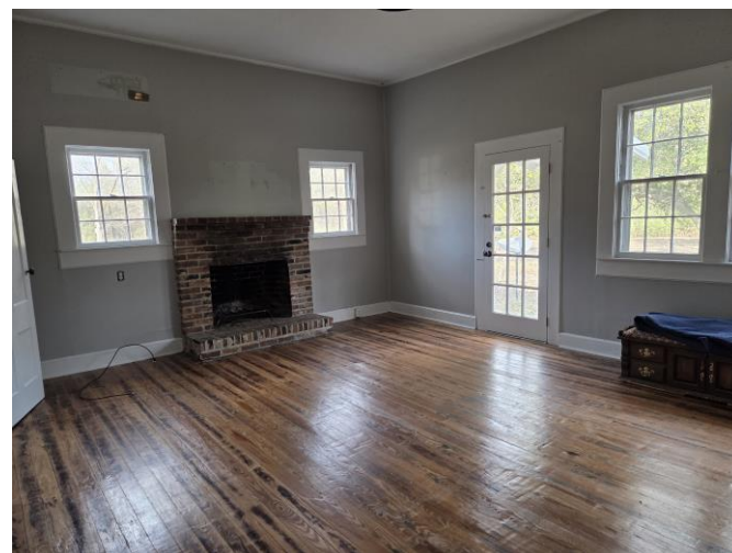
3 rd Bedroom or Den