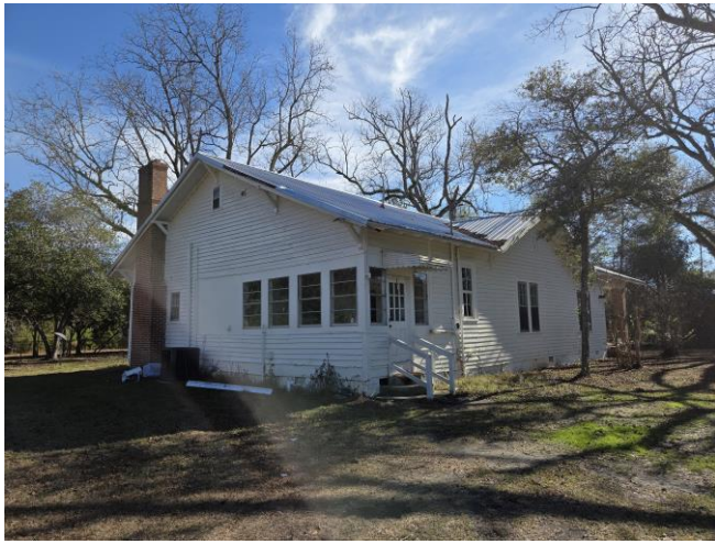
Back View of House